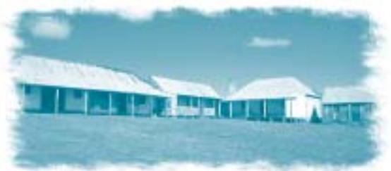
London Bridge Homestead

There are numerous fire trails throughout the reserve that provide great opportunities for mountain biking. However, it is important that riders stay on the fire trails as off-trail riding will cause erosion and subsequently reduce the quality of our water. Mountain bike riders should not ride on designated foot tracks. Googong offers two excellent rides—see descriptions under ⑥ and ⑧ for details. Please contact the rangers if you are intending to undertake a long ride.