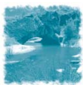
London Bridge Arch

At Googong there's something for everyone. It's all yours— explore it all.